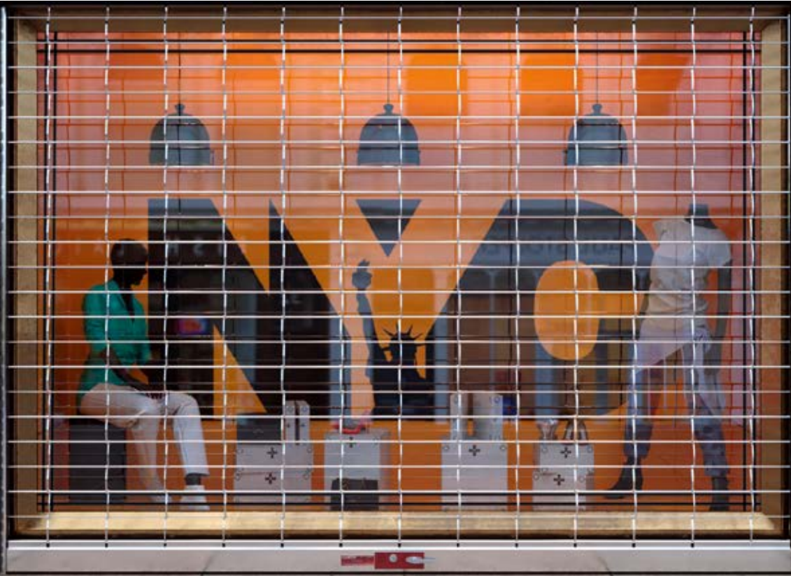
Model CESG10C Door